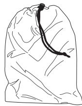
Exterior Pocket Liner Bag x 3